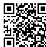
Videos from Bali World Culture Celebration.