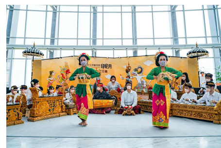
A performance at the opening ceremony of "2021 NPM Asian Art Festival — Indonesian Month" at the Southern Branch of National Taiwan Museum.