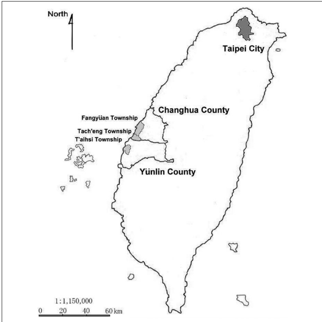
Figure 1. The proposed sites of KP. Note. KP = Kuokuang Petrochemical Park.

Understanding that a single-case research design has limited power in generalization, I position my study as a preliminary attempt to explore a particular way to make opportunity via strategic bipartisanship. Before bringing in Taiwan's case, I will begin with a theoretical discussion on the interaction between movement activism and political parties.