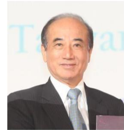
Founder Jin-Pyng Wang

Founded by the former president of the Legislative Yuan of Taiwan, Mr Jin-Pyng Wang, IBMI is an independent, not-for-profit organization voicing Taiwan-based health care industry, promoting interdisciplinary collaborations through its global platform, and creating policy dialogues between public and private sectors. On top of that, IBMI is also a trusted awarding and certification body to health care providers and an incubator to health care startups in areas of novel technologies, services and innovations.