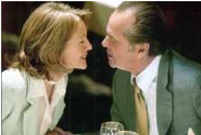
Diana Keaton and Jack Nicholson Something's Gotta Give (愛你在心眼難開)