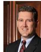
James Bullard (49) Fed St. Louis FOMC Alternate Member PhD, Indiana