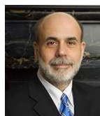
William C. Dudley (59) Fed NY/FOMC Vice Chairman FOMC Voting Member PhD, UC Berkeley