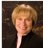
Janet L. Yellen (65) Fed Vice Chairman FOMC Voting Member PhD, Yale