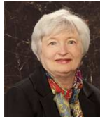
Ben S. Bernanke (58) Fed/FOMC Chairman FOMC Voting Member PhD, MIT