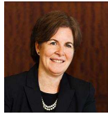
Esther George (53) Fed Kansas City FOMC Alternate Member MBA, UMissouri-Kansas City