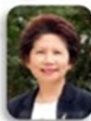
Prof. Yu (USA/Taiwan)

GD2-targeted immunotherapy of neuroblastoma