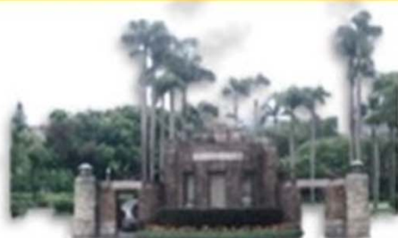
The Main Entrance of National Taiwan University

主辦單位:台灣神經母細胞瘤研究團隊 台灣大學生物技術研究中心 台灣大學發育生物學與再生醫學研究中心 聯絡e-mail: neuroblastomatw@gmail.com (陳彩碧小姐) 網站: http://sites.mc.ntu.edu.tw/lab/neuroblastoma 協辦單位:台灣神經母細胞瘤病友關懷協會 中華民國兒童癌症基金會 台北醫學大學 日本神經母細胞瘤研究團隊 財團法人謝伯潛謝伯津醫學教育基金會