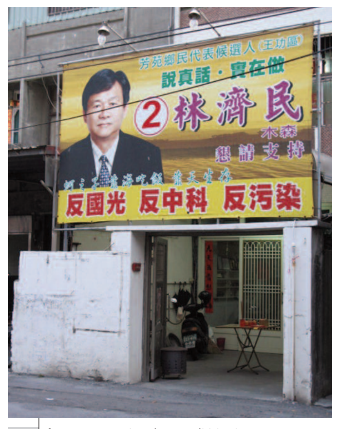
Photo 2 – An anti-Kuokuang politician in Fangyuan Township. The anti-Kuokuang movement succeeded partly because of the strong local opposition to the project. This candidate for a township-level election featured his anti-pollution commitment during the campaign.

ginning, local politicians of all stripes led the movement, but their involvement subsequently declined for two reasons. First, China Petroleum Corporation decided to scale down the project by "upgrading" the existing