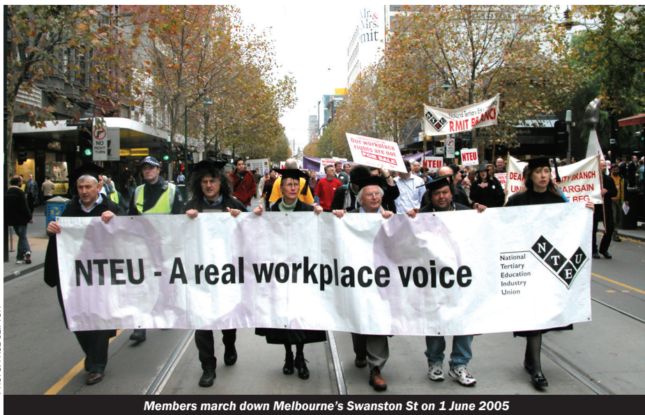
Members march down Melbourne's Swanston St on 1 June 2005

www.nteu.org.au/campaigns/higheredatrisk/gallery