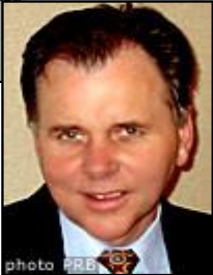
Dr. Barry Marshall The 2005 in Medicine

Barry Marshall Nobel Laureate Medicine 2005 At 112 nd Anniversary Symposium 26.6.2007