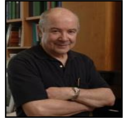
Dr. Johann Deisenhofer The 1988 in Chemistry

A most interesting tour showing the NTU Research Center of Medical excellence, thank you Robert Huber (ROBERT HUBER)