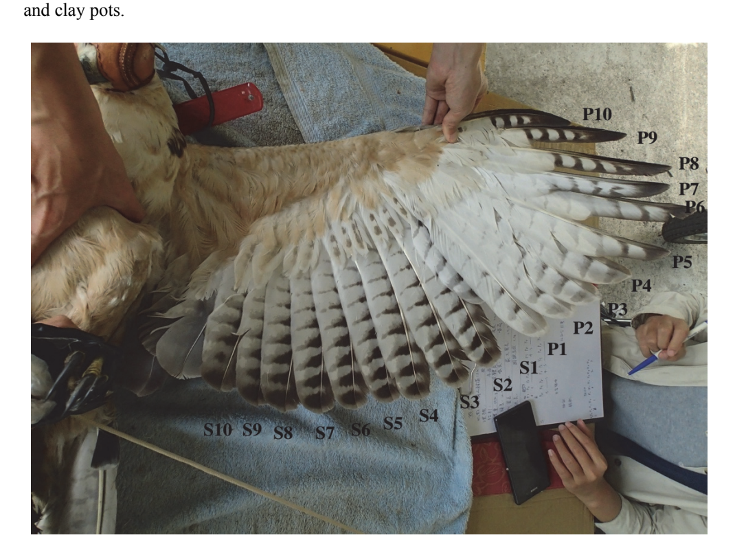
Figure 2 Positions of primary (P10-P1) and secondary (S1-S10) feathers of the mountain hawk eagle

Changes and Conflicts in the Use of Mountain Hawk-eagle Feathers among Rukai Communities in Taiwan high prestige and status of the family during the wedding process. It further illustrates that the special value of the mountain hawk-eagle feathers is sufficient to match that of the glass beads