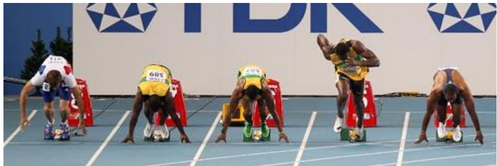
Bolt false start

http://bestplayerintheworld.com/wp-content/uploads/2011/08/Bolt-false-start.jpg